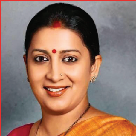
Smriti Zubin Irani

Smriti Zubin Irani is a distinguished politician with over two decades of experience, including a decade as a Cabinet Minister (2014-24) and a three-time Member of Parliament. Mrs. Irani has held multiple ministerial portfolios, including Women & Child Development, Minority Affairs, Human Resource Development, Information & Broadcasting, and Textiles. She was India's youngest Cabinet Minister and the first woman to serve as Union Minister for HRD and Textiles.